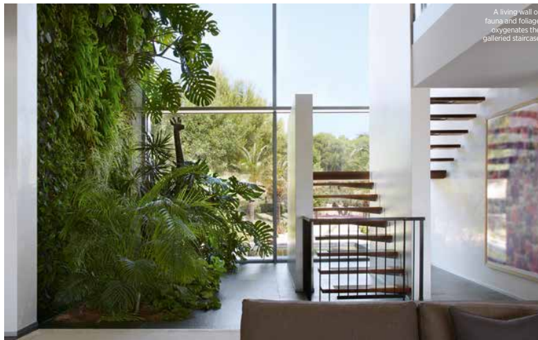
A living wall of fauna and foliage oxygenates the gallery staircase

With her family as one of her early clients, they were able to experience this passionate ethos firsthand. Not only is their beautiful eight-bedroom Balearic villa an idyllic family retreat that affords them the utmost privacy, spread across four beautifully landscaped hectares, it has emotional ties, too. This is where she met her husband and shared their long-term dreams of owning a villa on one of the islands, something they realised four years ago. "I love projects with my family as the client as I'm able to truly let my ▶