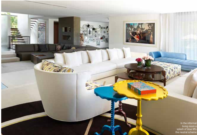
In the informal living room a splash of blue lifts the neutral scheme