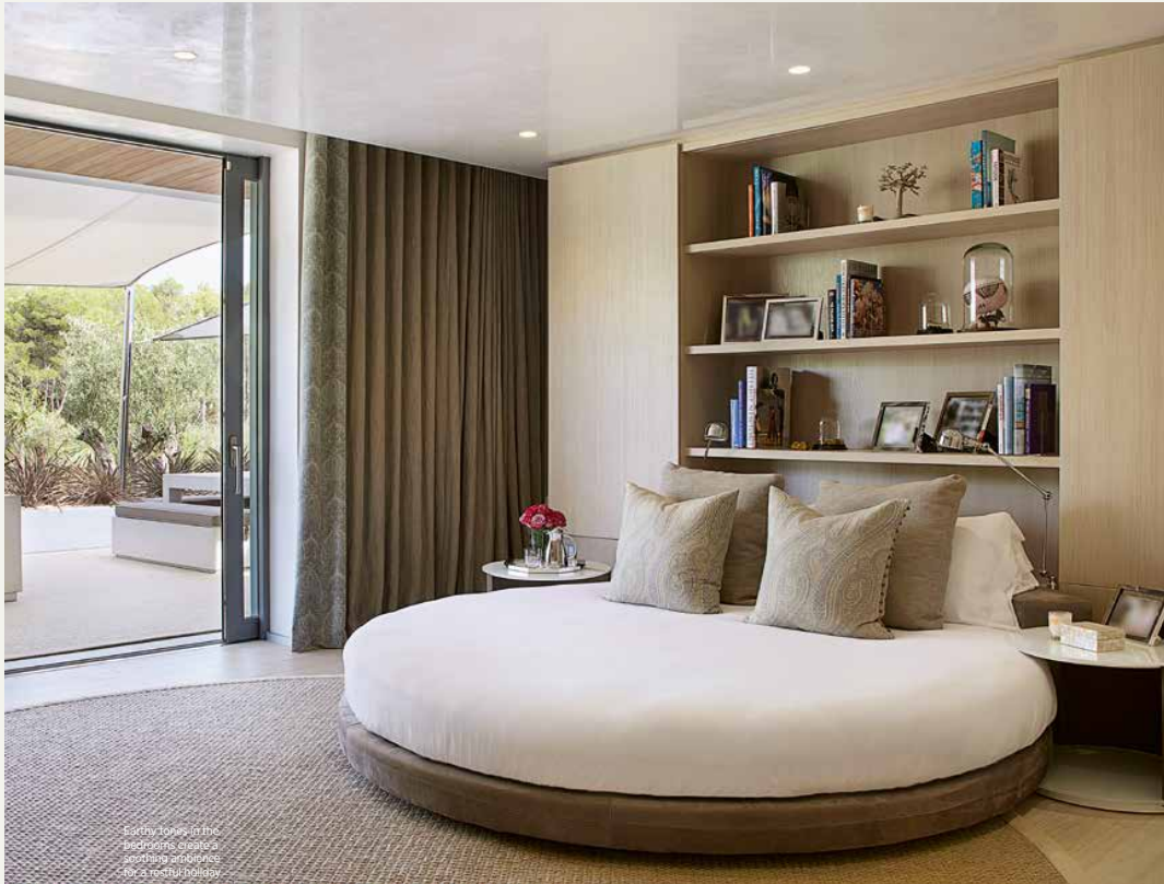
Soothing tones in the bedroom create something approachable for a restful holiday.

HARPER'S BAZAAR INTERIORS, May/June 2015